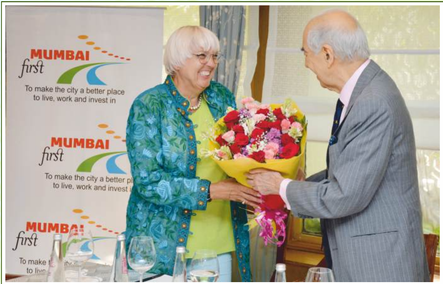
MUMBAI FIRST HOSTED A CLOSED-DOOR INTERACTIVE SESSION WITH MS. CLAUDIA ROTH, THE MINISTER OF STATE FOR CULTURE AND THE MEDIA, GERMANY