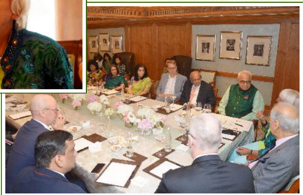
AZURE ROOM, THE TAJ MAHAL HOTEL, COLABA 23RD AUGUST, 2023