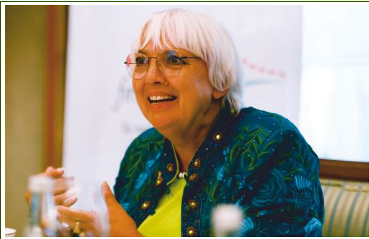
MS. CLAUDIA ROTH

SHE WAS ONE OF THE TWO PARTY CHAIRS FROM 2004 TO 2013 & PREVIOUSLY SERVED AS ONE OF THE VICE PRESIDENTS OF THE BUNDESTAG. SHE IS CURRENTLY SERVING AS FEDERAL GOVERNMENT COMMISSIONER FOR CULTURE AND THE MEDIA IN THE GOVERNMENT OF CHANCELLOR OLAF SCHOLZ SINCE 2021.