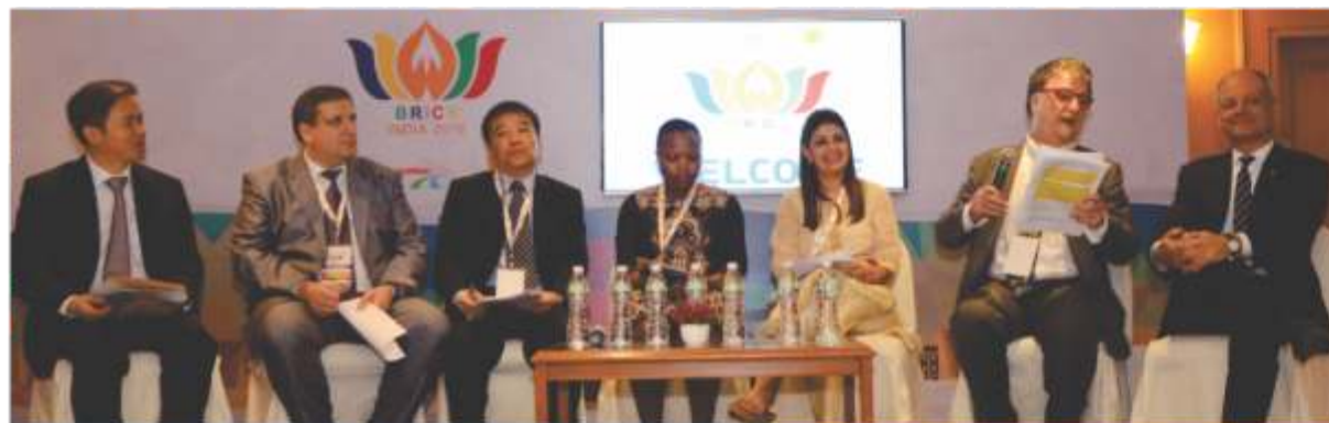
Panel on "Making BRICS Cities Inclusive"