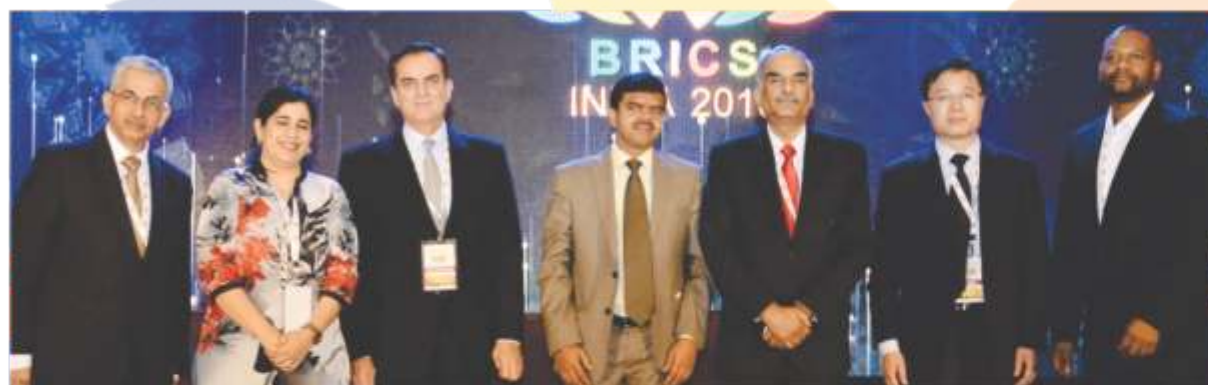
Panel on "Making our cities safe and secure"