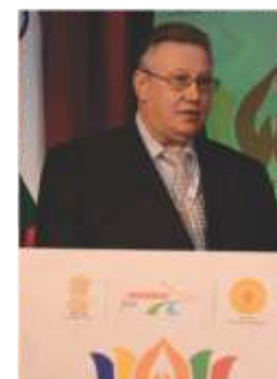
Mr Georgy Poltavchenko, Governor St. Petersburg