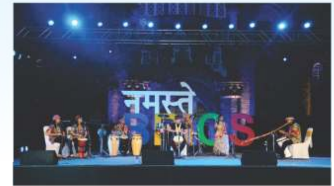
Drumcafe: Inspired by Communal drumming In Africa