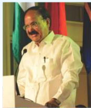
Mr Venkaiah Naidu, Union Minister of Urban Development