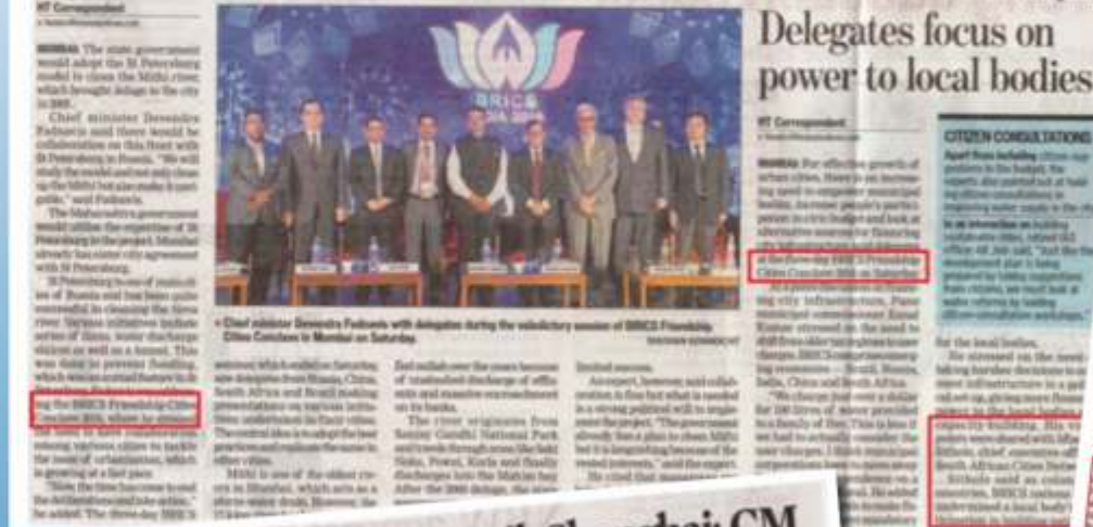
Chief minister Devendra Fadnavis with delegates during the inaugural session of BRICS Friendship Cities Conclave in Mumbai on Saturday

MODEL PLAN State to adopt St Petersburg's method of cleaning its Neva river to make the infamous Mithi clean and navigable