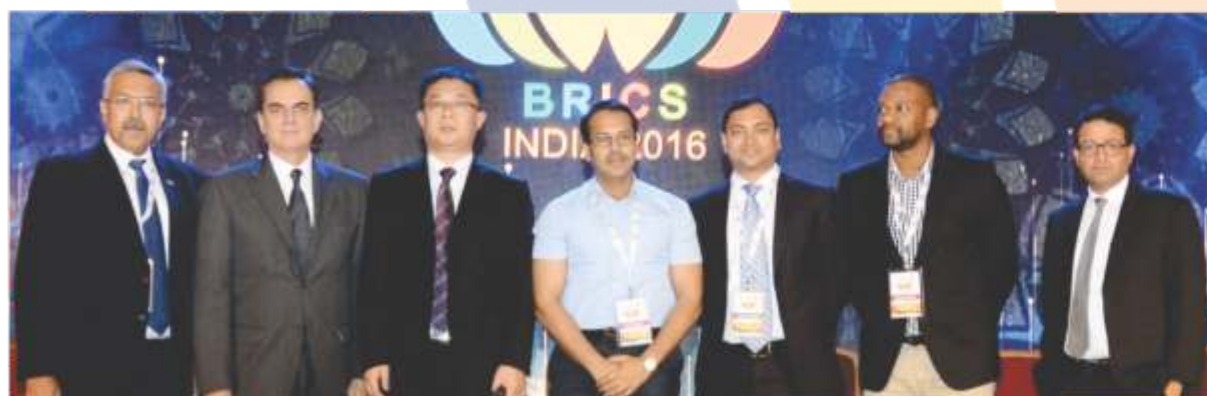
Panel on "Financing City Infrastructure"