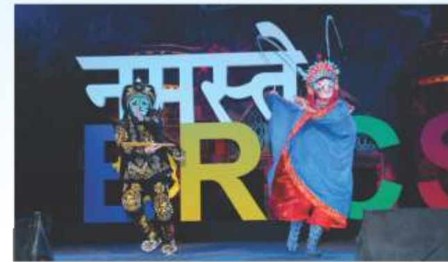
Sichuan Opera: One of the china's oldest local operas displaying its unique skills – the mask changing, dancing with water sleeves and rolling light.