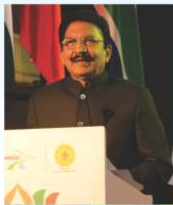
Mr C Vidyasagar Rao, Governor of Maharashtra