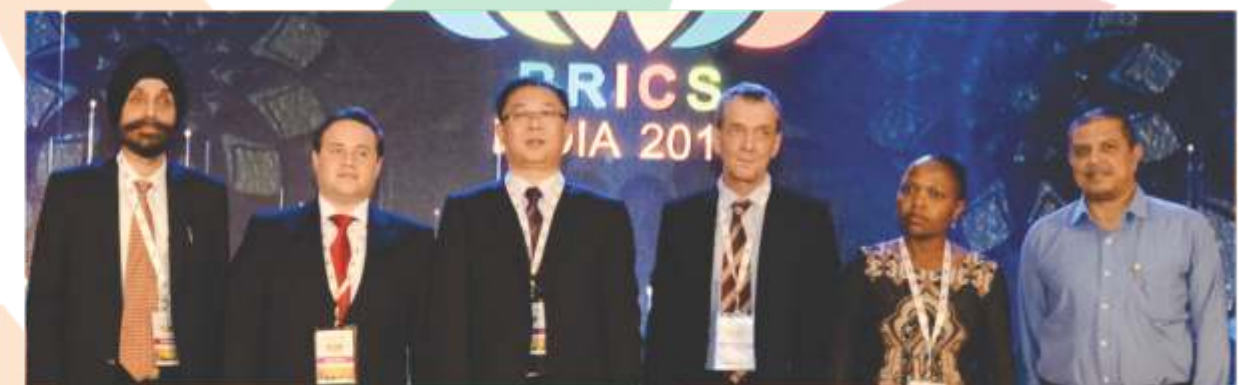
Panel on "Urban Transport: Fixing the nerve centre of cities to shift to transit-oriented development"