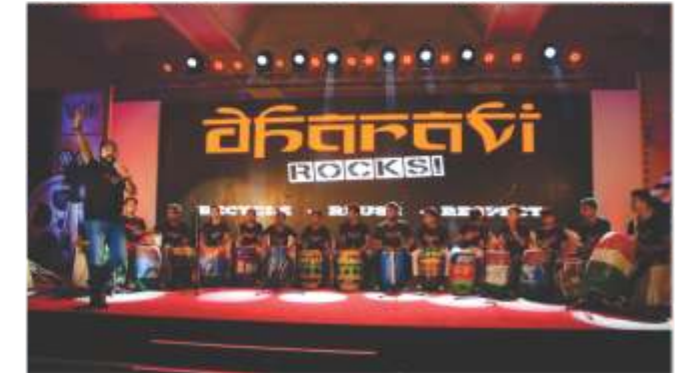
Dharavi Rocks: And they rocked. Children from this not so privileged pocket played drums and instruments made out of throwaway articles, to a standing ovation. The brand creatively uses scrap material and turns them into musical instruments, played by young kids from the Dharavi slums of CentralMumbai