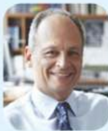
Shri. Devendra Fadnavis Chief Minister, Government of Maharashtra

"I would like to express my gratitude for organising the successful BRICS Friendship Cities Conclave. It was a wonderful opportunity to