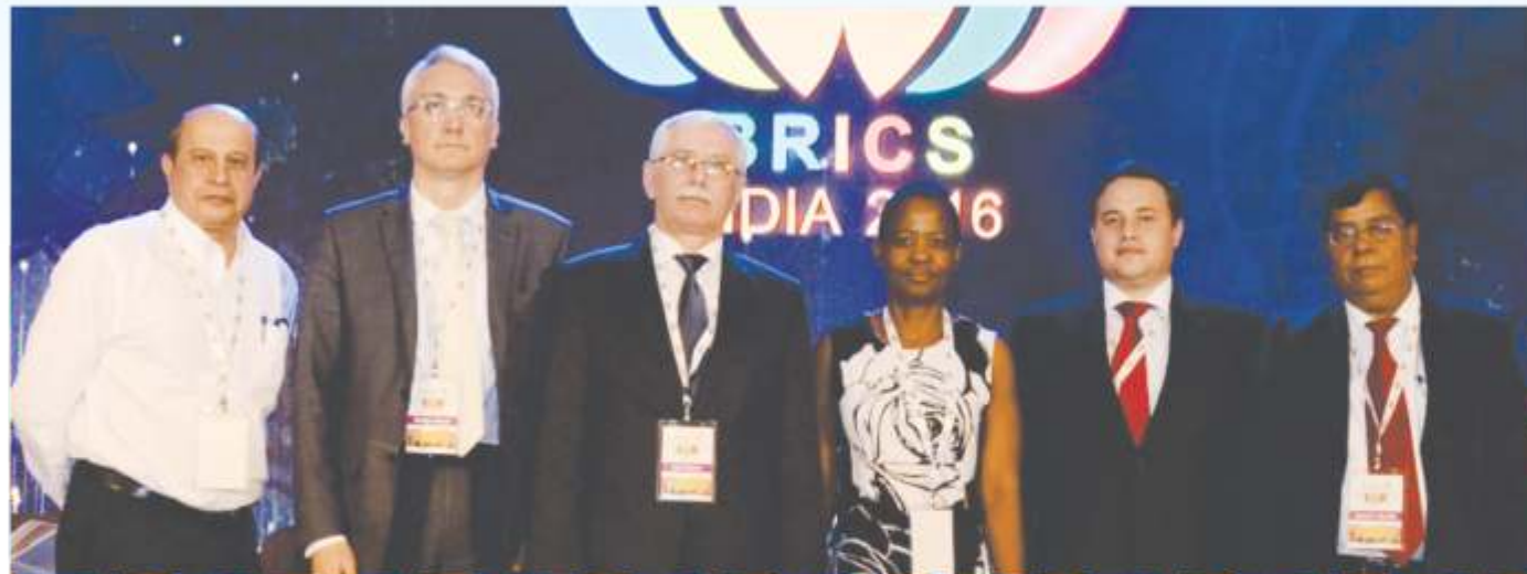
Panel on "Strengthening urban governance learning from successful models of city governance"