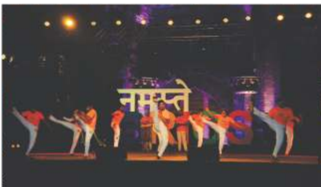
Capoeira: An Afro Brazilian art form that combines dance, martial art, music and Afro Brazilian culture.