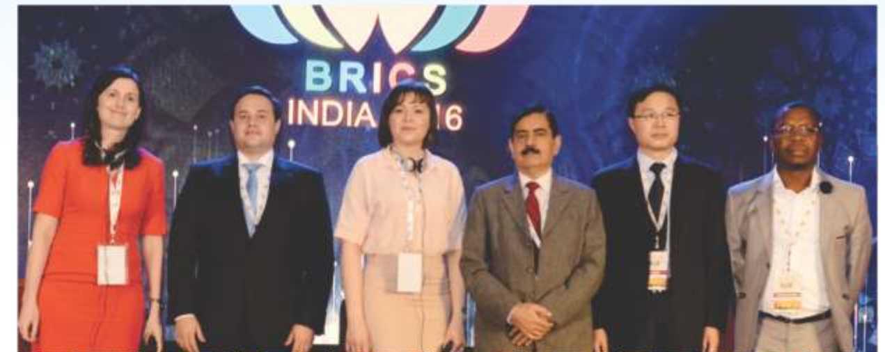
Panel on "Building sustainable cities to improve delivery of urban services"