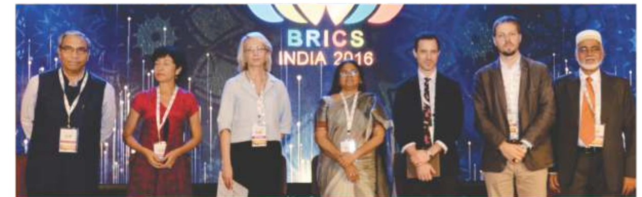
Panel on "Making Sustainable and affordable housing a reality"