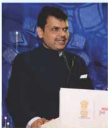
Mr Devendra Fadnavis, Chief Minister of Maharashtra