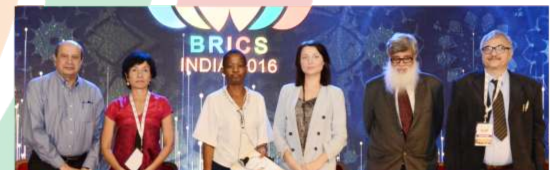
Panel on "Maximizing Value through Efficient land Use and Urban Planning"