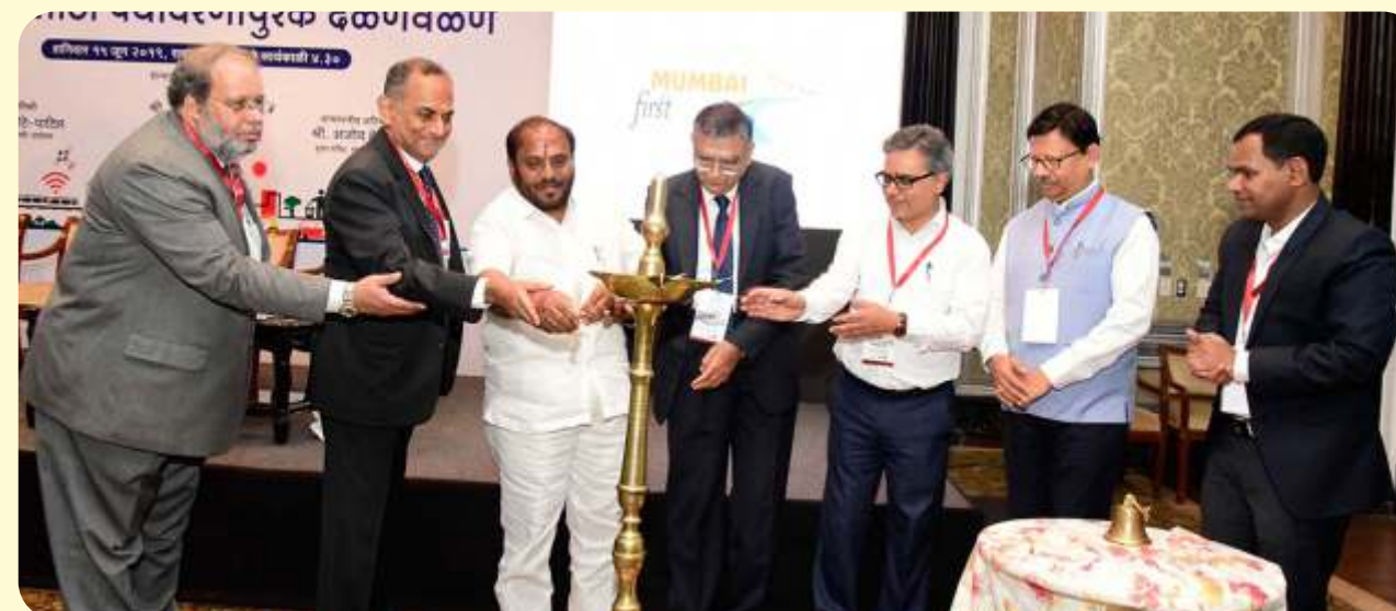
Conference on Eco-Friendly Mobility for Clean Air