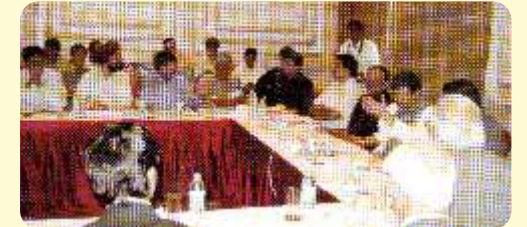
CAG was formed

As a result of the Vision Mumbai document, the Citizens' Action Group was Formed. The Chief Minister presided over the CAG while the BMC, MMRDA, MSRDC, etc., updated the gathering on their progress on various projects.