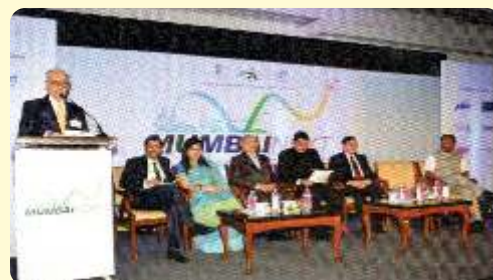
Mumbai Next - MMR Transformation "Transforming MMR into a Global Financial, Commercial and Entertainment Hub".

Mumbai First, supported by the Government of Maharashtra, organised the conference that left all attendants thinking "I have never been to a conference like this one" witness the Chief Minister Devendra Fadnavis present through the entire event. After listening to expert opinions, he announced his plans for the future of Mumbai. To achieve these plans, he also set up the War Room and the CM's Transformation Office.