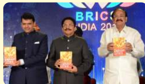
BRICS Friendship Cities Conclave

During India's presidency of the BRICS Nations, and with active support and participation of the Government of India and Maharashtra, Mumbai First hosted the "BRICS Friendship Cities Conclave" with representation from Brazil, Russia, China and South Africa. Topics discussed included Urban Governance, Making Cities Inclusive, Safe and Secure, Urban Transportation, Finance, Sustainability, Affordable Housing, Land Use and Land Planning.