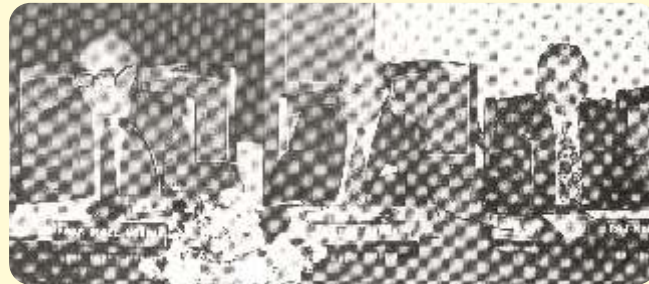
"Mumbai as an International Financial Centre - A Roadmap"

The report presentation was made to the Chief Secretary of Maharashtra and also received appreciation from the Reserve Bank of India