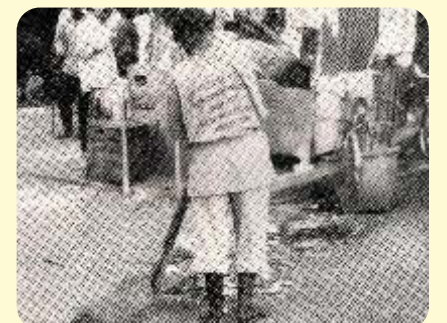
The Clean-Up Churchgate Project

Conducted along with Marine Drive Citizens Association, Oval Cooperage Residents Association, Maharshi Karve Road Association, Nariman Point Churchgate Citizens Association to clean the streets in the Churchgate and Marine Drive area.