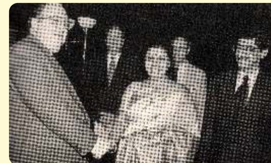
"The City: Its Promise - Realist and Renewal"

A seminar organised by Bombay First and The Corporation of London to discuss the will of the citizens and the government to act on improving the city.