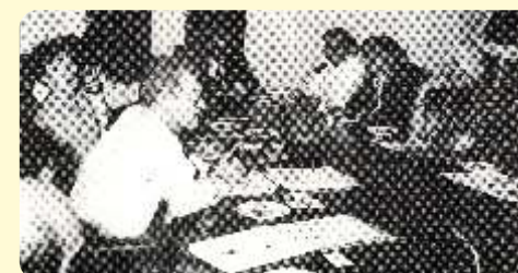
Creating of Transport Task Force

Bombay First joined forces with the Collector of Mumbai, Dr. Sanjay Chahande and the Transport Commissioner to create a Task Force to address problems of Mobility in Mumbai