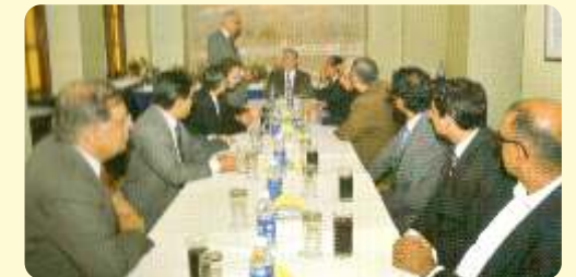
Hostage Negotiation & Crisis Management Course

Mumbai first hosted a team of Experts from New Scotland Yard Police, UK, at Bandra Kurla Complex Police Station to train the team in hostage negotiation. The certified course saw 8 officers excel in their course and the Mumbai Police unit was immensely appreciated for their skills