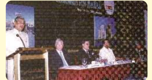
International Conference on Urban Renewal

Recognising the importance of the topic, the conference was supported by the Government of Maharashtra, BCCI, MMRDA and Tata Group of Industries. The conference hosted speakers from the UK, Australia, South Africa and Norway along with special presentations being made by representatives from The World Bank and London First.