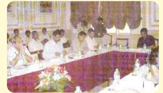
Security and Resilience Summit - Securing the City of Dreams

The summit platform was the first to see the plans the Mumbai Police had put into place following the 26/11 attacks. Following this, experts from across the world gave their opinions on what changes could be introduced to the plan in order to ensure maximum security. Experts included representatives from the US, UK, UN, London First, Bank of England and Counter Terrorist groups from a number of countries.