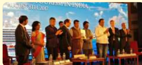
Dawn of Cruise Tourism in India in Collaboration with Mumbai Port Trust.

To showcase their preparedness to host cruise vessels and sensitise the stakeholders, Mumbai Port Trust(MbPT) and Ministry of Shipping in collaboration with Mumbai First organised an exclusive preview to "The Dawn of Cruise Tourism in India". 3 reports were released at the conference with the aim to bring uniformity in procedural formalities to transform cruise tourism in India.