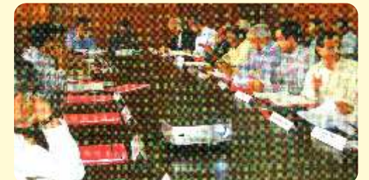
Constitution of Empowered Committee

The Empowered Committee was constituted by the Government of Maharashtra under a Government Resolution with the objective to oversee planning and accelerate the implementation of projects and policy changes in a coordinated manner. with the goal of Transforming Mumbai into a World Class City. The committee included 8 members from the private sector.