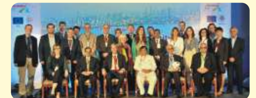
Bombay First-EU International Summit "The Challenges of Mumbai as a Mega City".

The Summit was held in association with the EU and the Government of Maharashtra to outline some of its challenges and ways to overcome them. Topics discussed during the summit include Integrated Urban Governance, Affordable Housing, Urban Mobility, Environment, Waste Management and Energy.