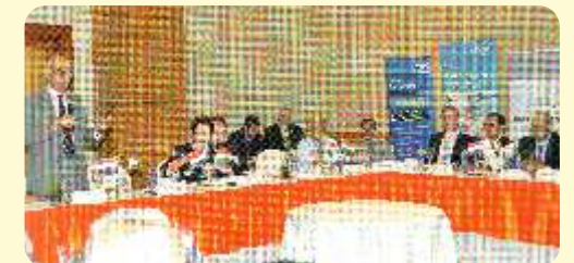
Training and Special Course on "Building with Nature" & "Roundtable on "Tackling the Waves, Coastal Development and Land Reclamation"

Bombay First began its focus on Sustainable Development in 2006. In this regard, we held a special training organized along with the Dutch Authorities on ways to build along with nature instead of building on nature. Present were representatives from Holland, Netherlands, MMRDA, Airport Services, etc.