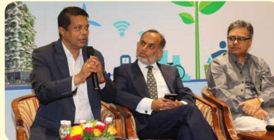
"Championing Cleaner Air and Cleaner Skies"

The Panel Discussion, organized along with the Maharashtra Pollution Control Board and CSIR-NEERI focussed on the worsening air quality in Mumbai, its causes and mitigation measures.