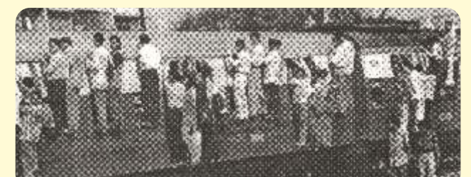
"Comprehensive Transport Strategy Document for Mumbai"

The Mumbai First Transport Committee conducted a study to understand the needs of the commuter for the next decade, taking into account various modes of commuting namely rail, road and water transport.