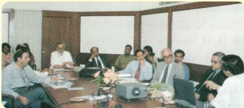
Research Project on "Revitalising Mumbai and Creating Jobs"

Resulting from a number of economic slumps, Mumbai witnessed the closing down of textile mills to move to cities outside of Mumbai. Keeping regeneration of employment as the major goal, Mumbai First commissioned Avalon Consulting Group for a study on this subject.