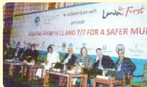
Conference on Megamorphosis - International Conference on "Resurgence of Mumbai"

The conference was held with the support of MMRDA, CIDCO, MTSU, BMC and The World Bank to take stock of all the work done since the "Vision Mumbai" document was released and plan for the years to come. Outcomes of the conference included White papers on Housing, Physical Infrastructure, Education, Governance, Economic Growth Healthcare as well as a conference on "Lessons from 9/11 and 7/7 for a Safer Mumbai organised along with London First.