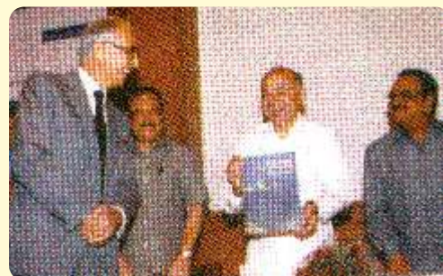
Launch of the Vision Mumbai Report